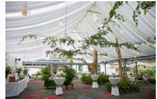
the south garden

cocktail reception: 220 guests dinner with dancing: 150 guests dancing & desserts: 220 guests