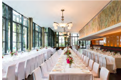
grill dining room

seated panel: 220 guests cocktail reception: 200 guests buffet reception: 150 guests